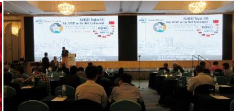
Region XIII Technology Award