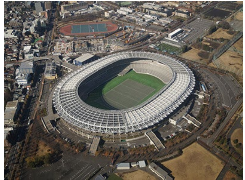
New stadium for Tokyo Olympic and Paralympic